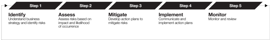
Figure 1: KOM's five-step process 25

KOM's five-step process from risk identification, assessment, mitigation, implementation and communication to risk monitoring and review in their day-to-day operations and discussions.