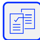
Preparing for an interview