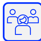
Preparing for your first leadership role