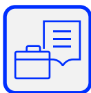
Interviewing for an executive role