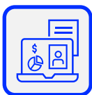
Career planning in finance