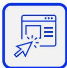
Enhancing your LinkedIn profile