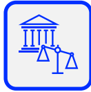
Ethics and integrity