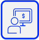
Data and digital

Simply pick the topics you'd like to know more about and start learning at a pace that suits your schedule. Display your digital badges online upon completion of the course.