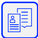
Building your resume