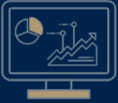
Data analytics and visualisation software