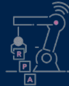
Robotic process automation