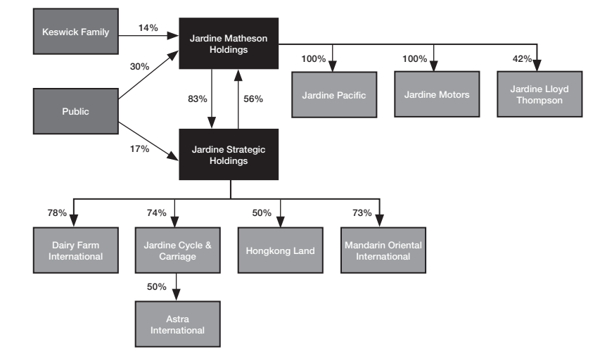
Exhibit 1: Simplified Jardines Crossholding Chart<sup>8</sup>

Jardines' controlling shareholder is the Keswick family, and members of the Keswick family also play key board and management roles in the different companies within the group.